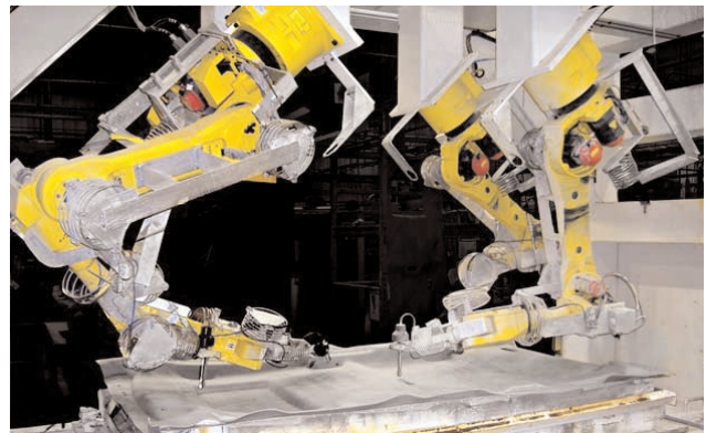
IAC's JetTool system is most often used to trim headliners.

IAC uses KMT's programming expertise on a regular basis. KMT programmers assist with new product launches so IAC engineers and process techs can focus on other areas of the launch. IAC now has two programmers versus four. IAC also used KMT's training services to help the process technicians become more efficient. The training conducted at KMT saves IAC time since it had been difficult to find the time to train the technicians in the past.