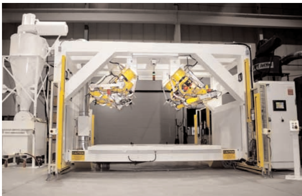
This KMT JetTool Gantry-style waterjet system is equipped with four AccuTrim WJ-44 robots.

International Automotive Components Group in Madisonville, Kentucky, (formerly Lear Madisonville) manufactures automotive headliners, blow-molded plastic automotive seatbacks, load floors and storage bins. In 2005, employees were preparing for a new product launch with a much higher production volume when they discovered that their existing Motoman system could not handle the increased volume, productivity levels and quality targets. IAC needed a new system that would reduce cycle time, meet the production and quality demands, and be installed and running within 10 weeks.